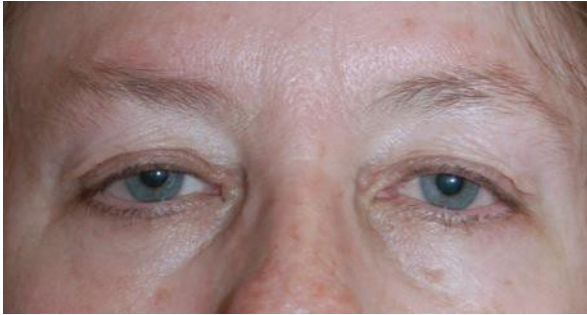
Figure 7. Frontal photograph with eyes in primary gaze demonstrating a clear corneal light reflex, MRD < 2 mm.