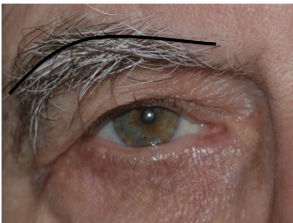
Figure 3. Brow ptosis. Note the proximity of the eyebrow hairs and the upper eyelid lashes. Brow rests below position of superior orbital rim (black line).