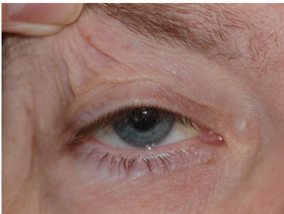
Figure 9B. With manual lifting of the eyebrow alone, the eyelid ptosis remains still causing visual obstruction. This example demonstrates the need for both brow ptosis and eyelid ptosis repair to restore normal visual function.