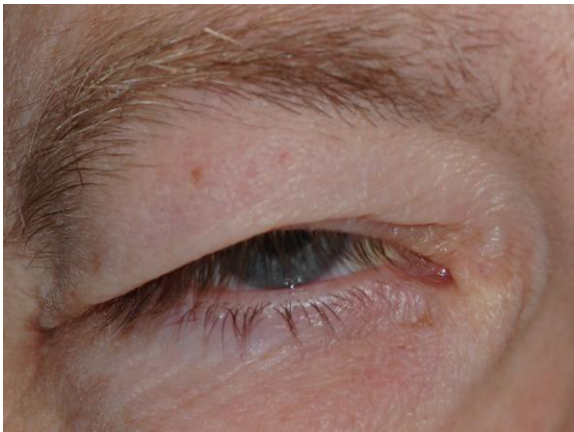
Figure 9A. Patient with functional brow ptosis and eyelid ptosis both affecting vision. .