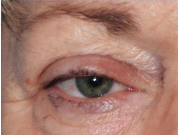
Figure 2. Upper eyelid ptosis with a margin to reflex distance (MRD) < 2mm.