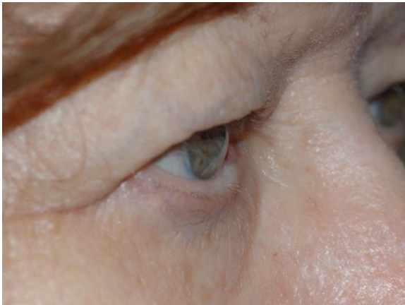
Figure 8. Oblique photograph demonstrating the excess upper eyelid skin resting on and depressing the eyelashes towards the cornea.