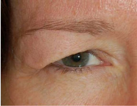
Figure 1. Visually significant upper eyelid dermatochalasis with excess skin fold draped over and depressing the eyelashes.